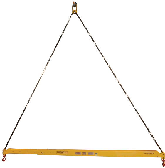
Shown with Option C